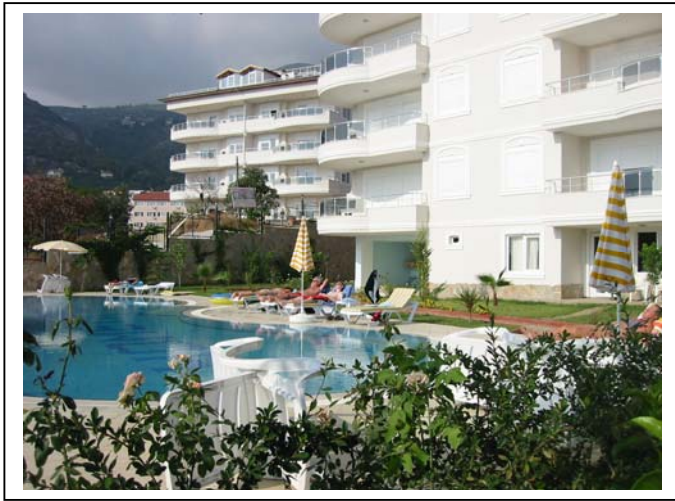
Pool area with garden and common area. Sun beds and parasols are free at your disposal. 130m2 pool with fixt depth of 160cm.