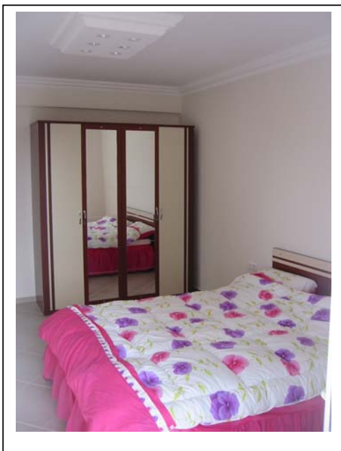
Master bedroom with double bed. Separate bathroom for master bedroom. Separate balcony for master bedroom.